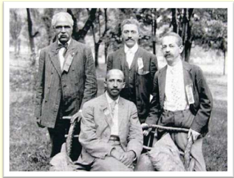
Harper's Ferry, 1906