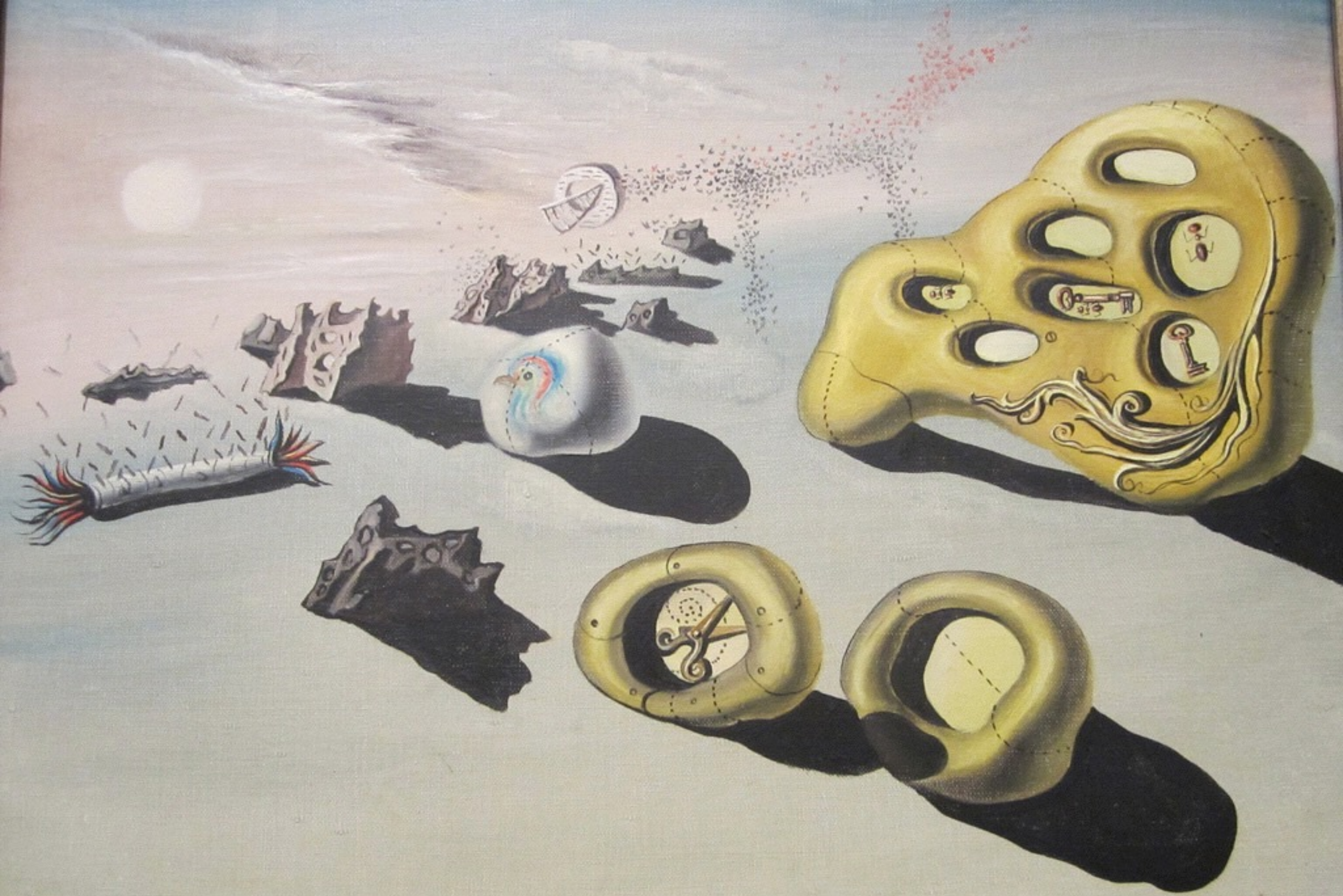
Dali - The Specter of Evening (1930)